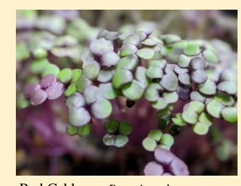
Red Cabbage; Brassica oleracea var. capitata