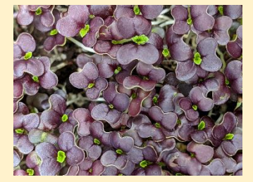
Garnet Giant Mustard; Brassica juncea