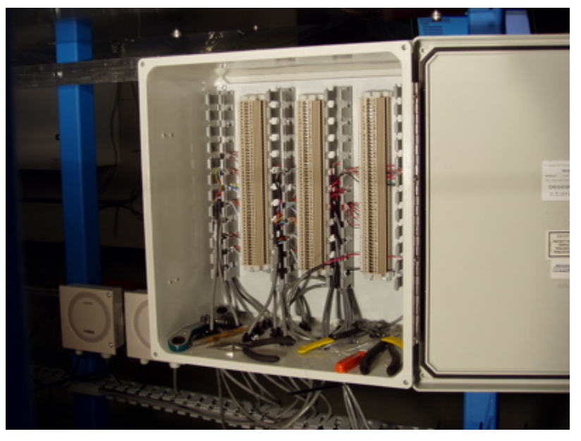
Figure 3-1. Photograph of one of two of the intermediate I/O interface wiring panels. Screw terminals and wiring conduit (below box) are shown. Eight wire cable is used for connections.