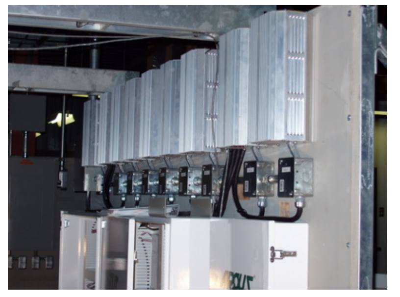
Figure 2-3. Photograph of the lighting system ballasts, contactors (below) and Argus I/O panels. The mounting frame for the ballasts as installed at the CESRF is also shown.