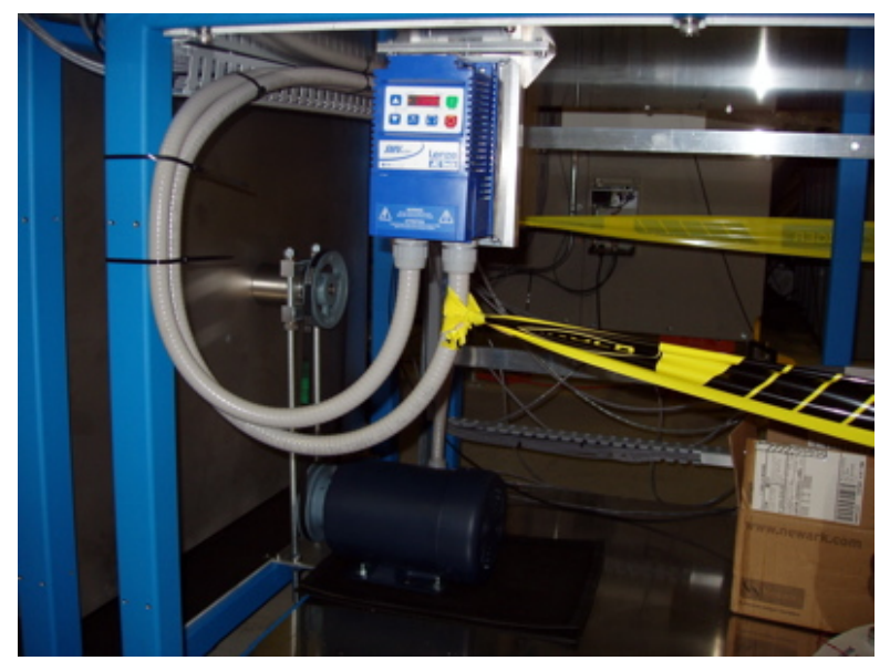
Figure 2-1. Photograph of the VFD (blue device) and blower motor (below). Power supplies to the VFD are through conduits supplied by the electrical contractor.