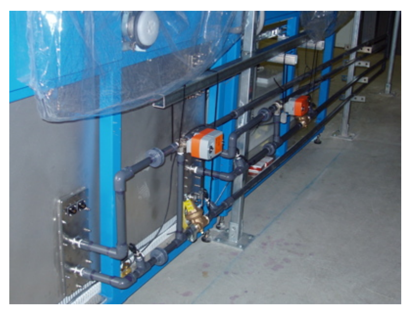
Figure 4-1 Photograph of the water supply service lines to the coils. The hot water coil (left) and chilled water coil (right) are connected to the proportional valve (orange device) and pressure regulator (brass device). Connection to and from facility supply is made to the pressure regulator and from the proportional valve, respectively.