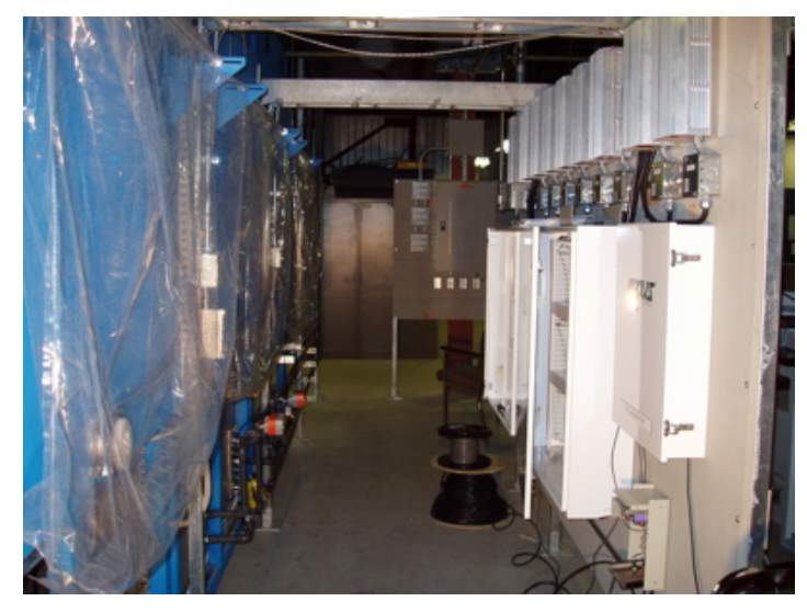
Figure 3-2. Photograph of mounting frames for ballasts in relation to the chamber. Shown are also the passive pressure compensation bladders.

Figure 3-1. Photograph of one of two of the intermediate I/O interface wiring panels. Screw terminals and wiring conduit (below box) are shown. Eight wire cable is used for connections.