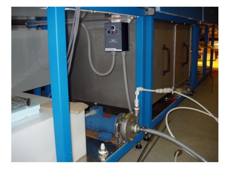
Figure 2-2. Photograph of the irrigation pump and manual speed controller (above). Power supplies to the pump are through conduits supplied by the electrical contractor.

terminals of the speed controller of the irrigation pump. Connection from facility power to the manual controller and irrigation pump must be specified and performed by a certified electrician.